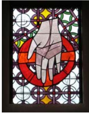
Hand of God

I am humbled to have the opportunity to journey with you through the Lenten season this year; and in person! Lent is a favorite liturgical time for me; I love the darkness, the quiet, the invitation to walk with Jesus into the wilderness in solitude. Perhaps that is why I have always been drawn to times of retreat, especially at Mercy by the Sea, where I can bask in quiet contemplation and prayer.